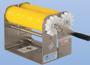
The „Maxi“ model (working width: 32,3 cm)