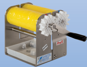
The „Profi“ model (working width: 24,3 cm)

The SCHNITZELMASTER can be ordered in four models